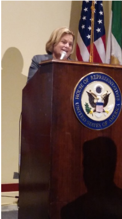
U.S. Representative Ileana Ros-Lethinan (R-FL)

Other than the ARCHumankind director also used the floor: