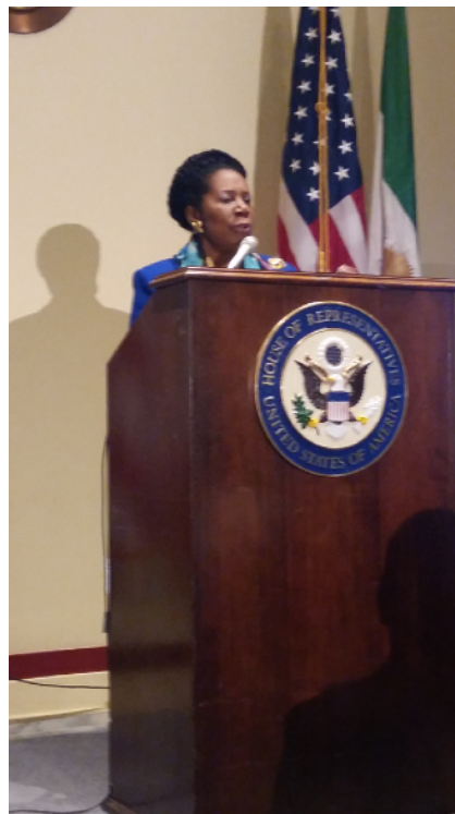
U.S. Representative Sheila Jackson Lee (D-TX)