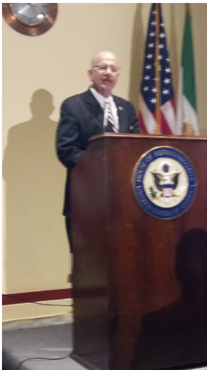
U.S. Representative Ted Poe (R-TX)