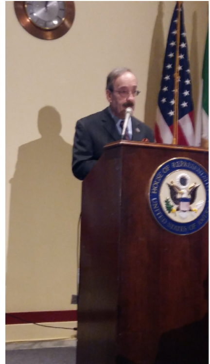
U.S. Representative Eliot Engel (D-NY)