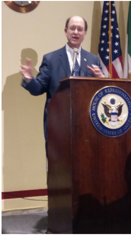
U.S. Representative Brad Sherman (D-CA)