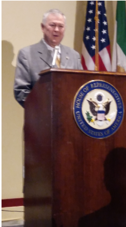
U.S. Representative Dana Rohrabacher (R-CA)